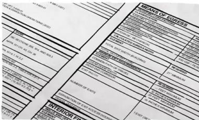
Narrative Portion of Life Safety Plans

(Often in a written, table, matrix, or number and text format)