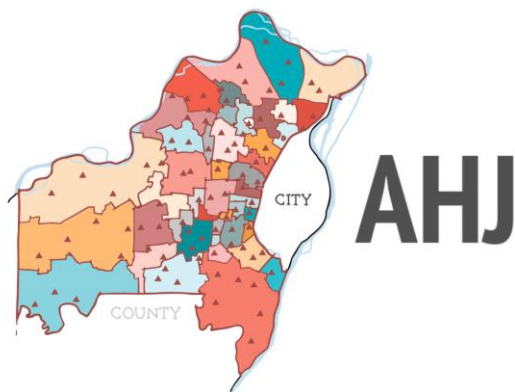
AHJ Authority Having Jurisdiction